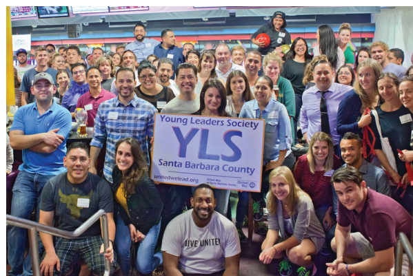
YLS members and guests at the 7th Annual United We Bowl

We look forward to seeing you at this year's 8th Annual United We Read on Friday, February 24, 2017. Join us as we read to students at two schools: Franklin Elementary (1111 E. Mason Street) from 8:30-10:00am and El Camino Elementary (5020 San Simeon Drive) from 10:00-11:00am.