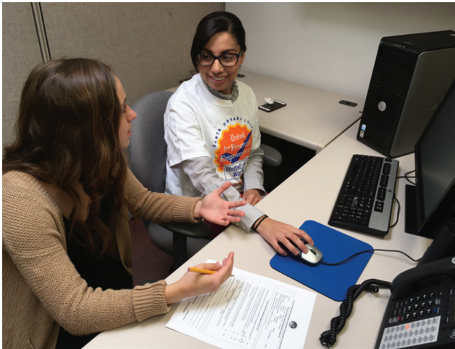
A VITA participant receives information about her taxes