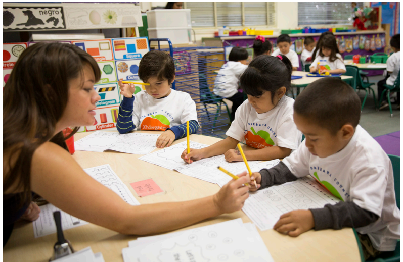
An instructor with Kindergarten Success Institutes participants at Harding Elementary School

Through KSI, UWSBC provides curriculum and credentialed teachers to help more than 150 students master the social/emotional, language, motor and approach to learning skills that are essential to their future success in kindergarten and beyond. This summer, dozens of incoming kindergarteners will learn the academic and social/emotional skills they need to be successful in kindergarten from day one.