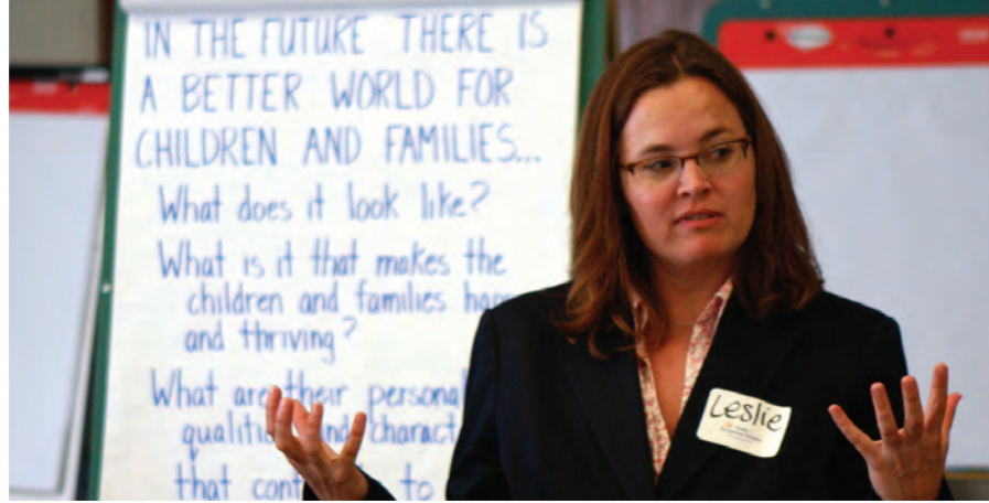
Photo: Community members taking the survey at a listening session held at the Braille Institute in Santa Barbara.

POPI COORDINATED TEAMS THAT analyzed successful programs adopted by other communities that had reached similar conclusions. They learned that 10 years earlier, community leaders in Madison, Wisconsin had brought residents together in an open process that created a vision with common goals for the community. This produced positive, long-lasting, and measurable changes in the decades that followed.