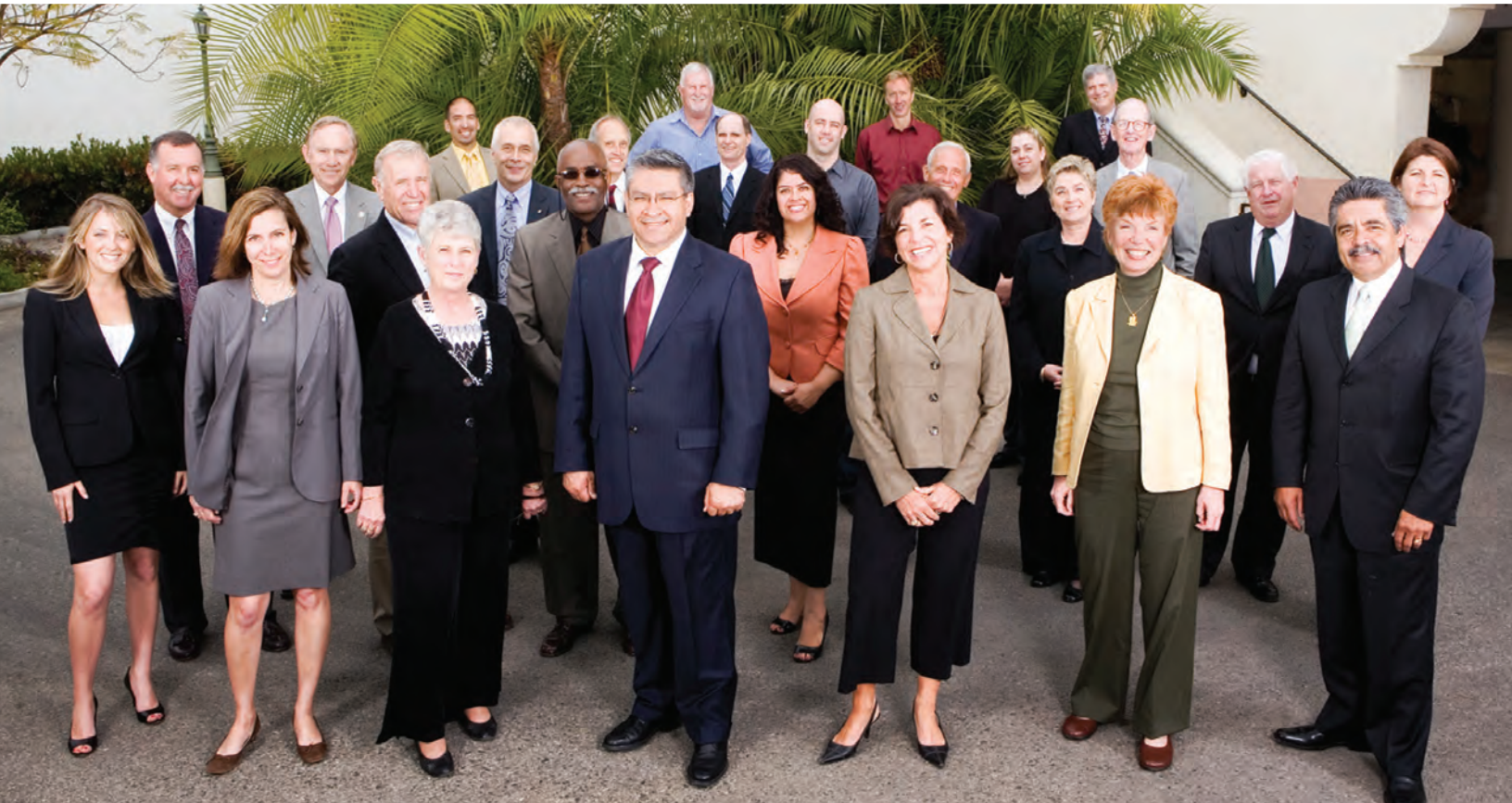
Photo: Power of Partnership Initiative Vision Council (some members not present)

The Power of Partnership Initiative (POPI) has become the largest community engagement effort in the history of the tri-counties. Since 2008, more than 5,000 community members, from all backgrounds, have come together to share their hopes and dreams for the future of children, seniors, and their families in our south coast communities. In addition, hundreds of community leaders, experts, and organizations have participated to clarify our community's vision and goals. Together, our community has reached an unprecedented level of agreement.