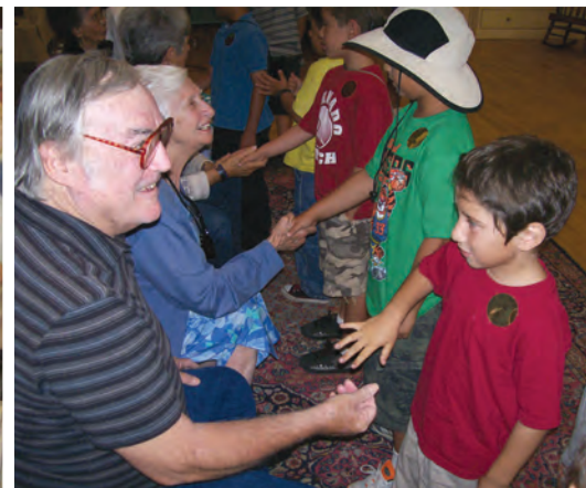
Photo: Members of the Retired Senior Volunteer program taking the community survey.