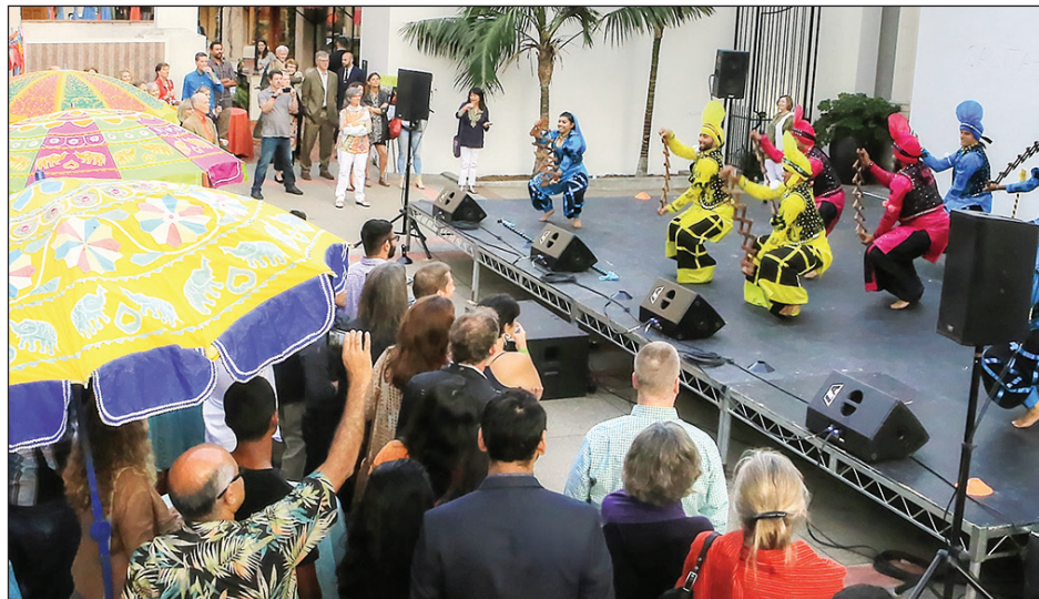
Guests are enthralled by power-packed Punjabi-style finale by UCSB Indian Dance group

Santa Barbara Museum of Art held its first Atelier event of the year, attracting 400 revelers to the tony State Street institution, where flowers reigned supreme, courtesy of our Eden by the Beach's garden club.